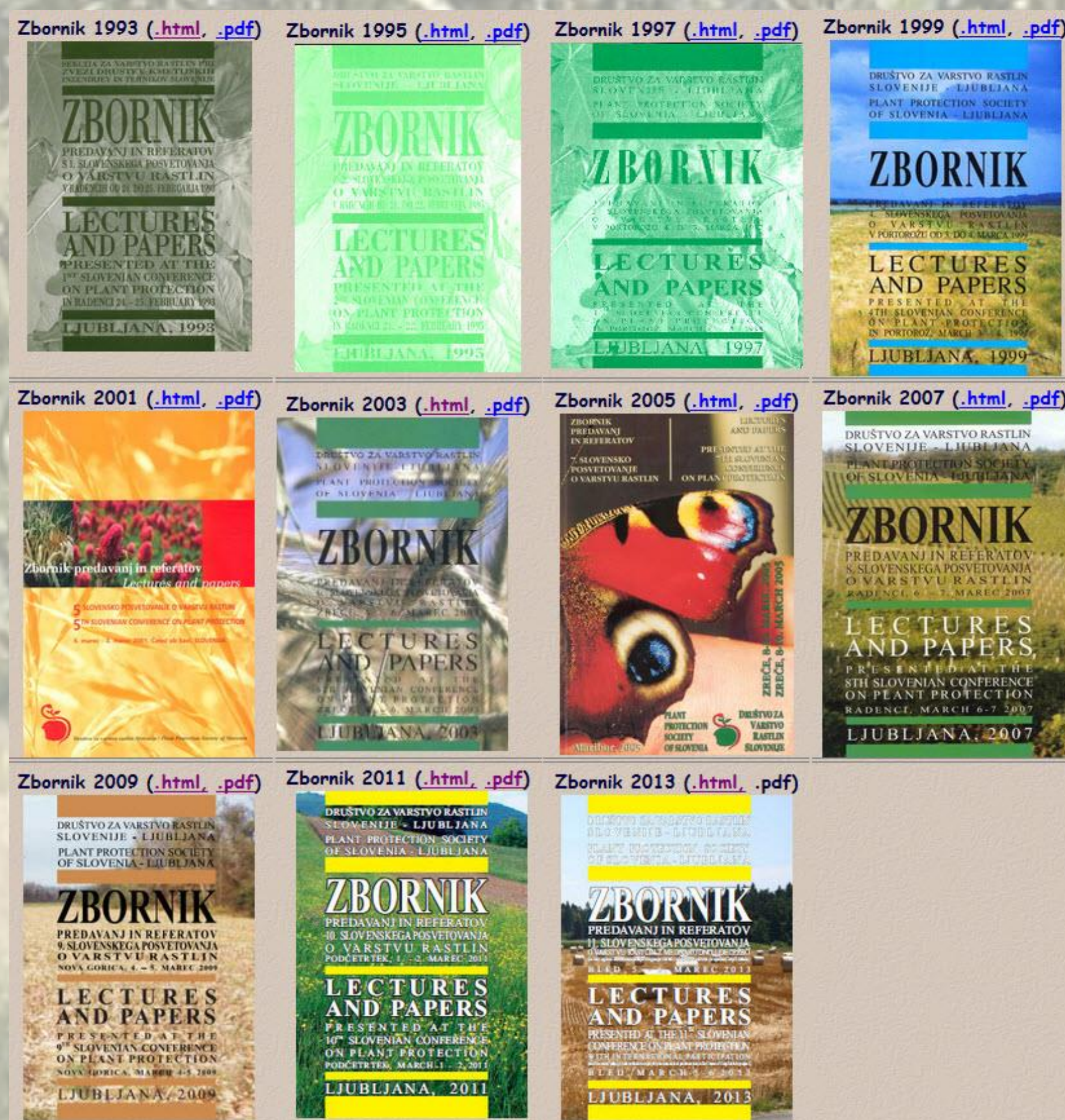
Figure 2: After all 11 Slovenian plant protection conferences the PPSS published proceedings of oral presentations and posters with 300-500 pages