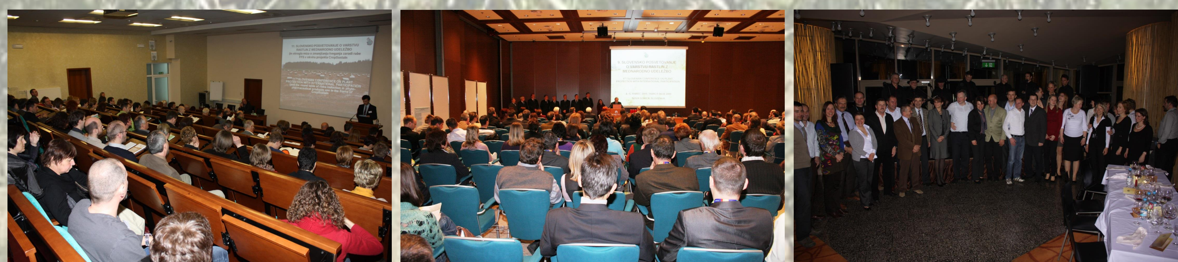
Figure 3: Slovenian plant protection conferences are usually well attended meetings and nice social events.